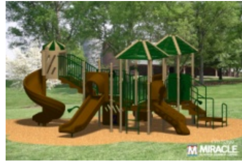
Diagram of the primary elementary play system that is the Parent Organization's goal for the Fall Festival fundraiser

This year's Fall Festival will be held on Friday, October 9 from 6:00 - 8:30 p.m. Come make new friends and enjoy food, square dancing with a live band, and activities for the kids while giving service to the school and raising money for the new elementary playground system.