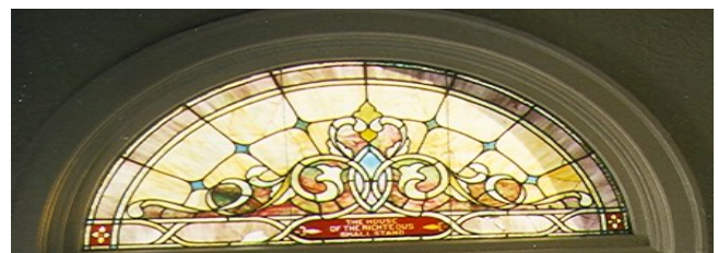
Stain glass window from the old AHS Pleasant Grove building "The House of the Righteous Shall Stand"

I am so grateful that I am able to come to this school. Here we can learn what we want to learn, and here we can learn to be the princes and princesses that will make this world a better place. If we take advantage of what is available here, we can gain more knowledge, more confidence in ourselves, and gain the confidence necessary to stand when standing is not easy.