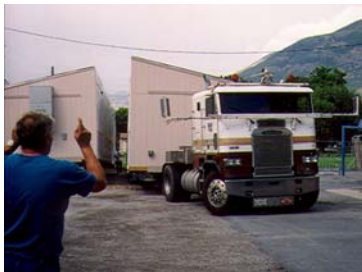
Portable trailers added to the old Pleasant Grove AHS building

In 2000 , portable trailers were needed to accommodate the School’s growing student enrollment of 275. The Board of Directors approved the relocation of American Heritage School to a new campus, which would