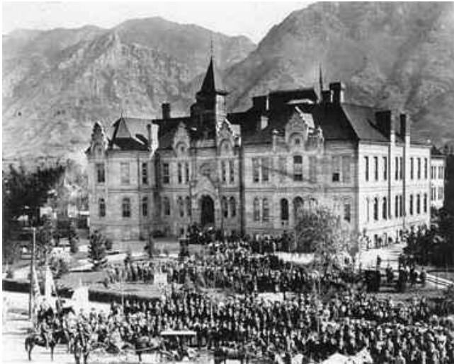
Brigham Young Academy, Founders Day, 1900

In 1896 , as a result of financial strain, the Board of Trustees of Brigham Young Academy voted to transfer the academy to the Church.